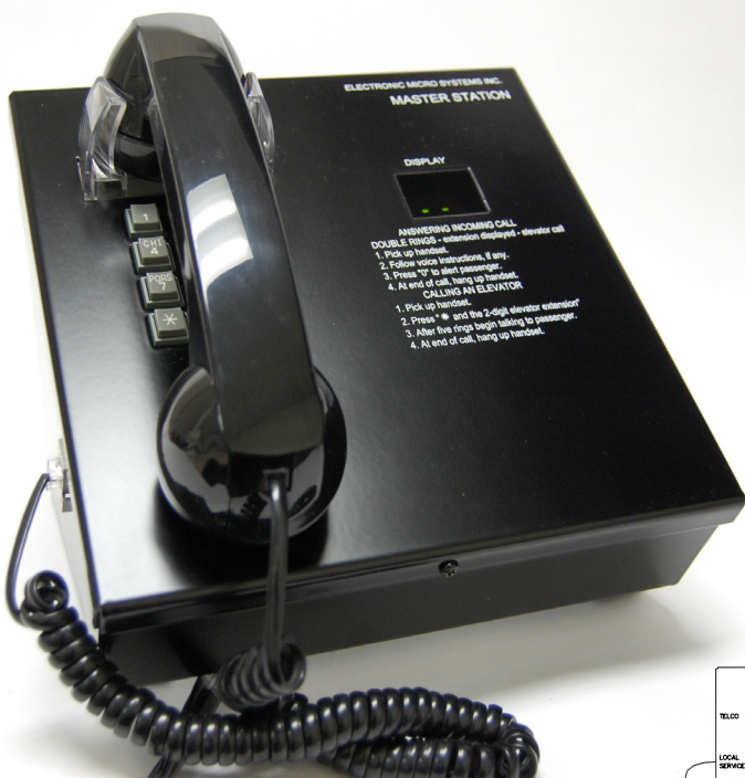
Master Station phone shown above