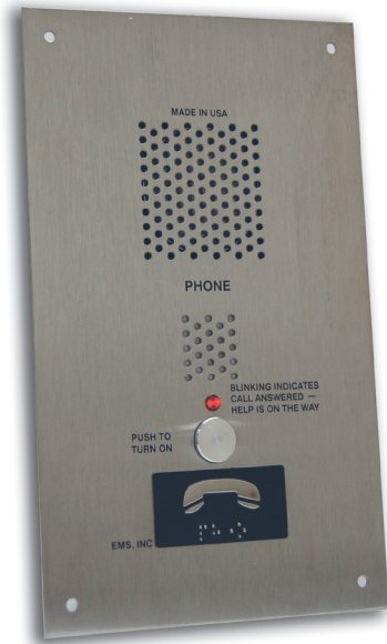
PSS shown above

Vandal resistant 16 gauge stainless Drop in retrofit solution